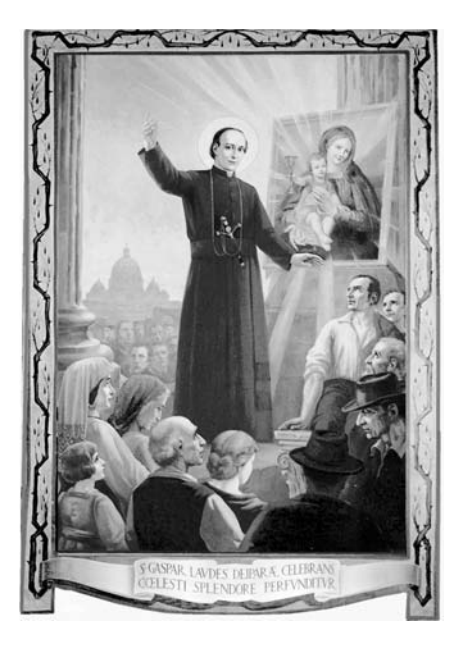
Canonization banner of St. Gaspar del Bufalo.