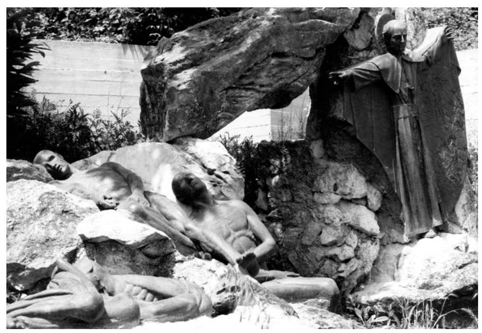
Statue of St. Gaspar protecting the victims of violence, located on a hillside outside the village of Patrica, Italy.

congregation grow. He stepped forward when the countryside fell into the grip of bandits who robbed and murdered at will, negotiating a peace with the banditi and saving the town of Sonnino, whose people still claim Gaspar as their personal saint (Pope Pius VII had threatened to raze the town, which had become the bandits' headquarters, but Gaspar begged for the chance to try to save it).